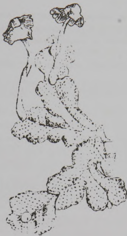
Fig. 2 Bucegia romanica - female plant (original by Radian 1923).